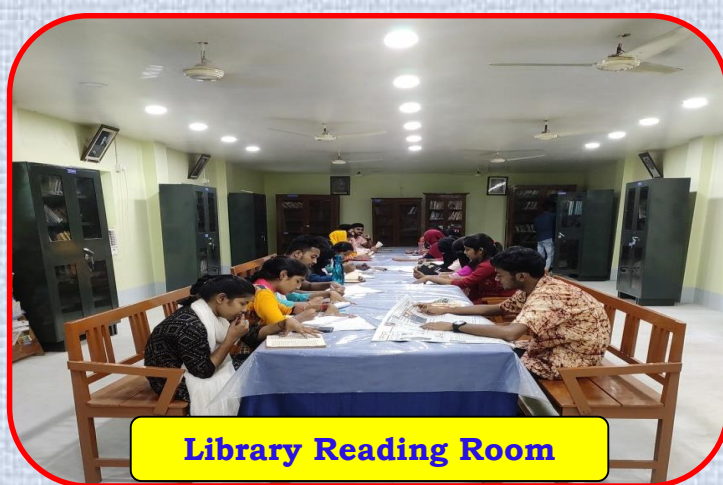
Library Reading Room