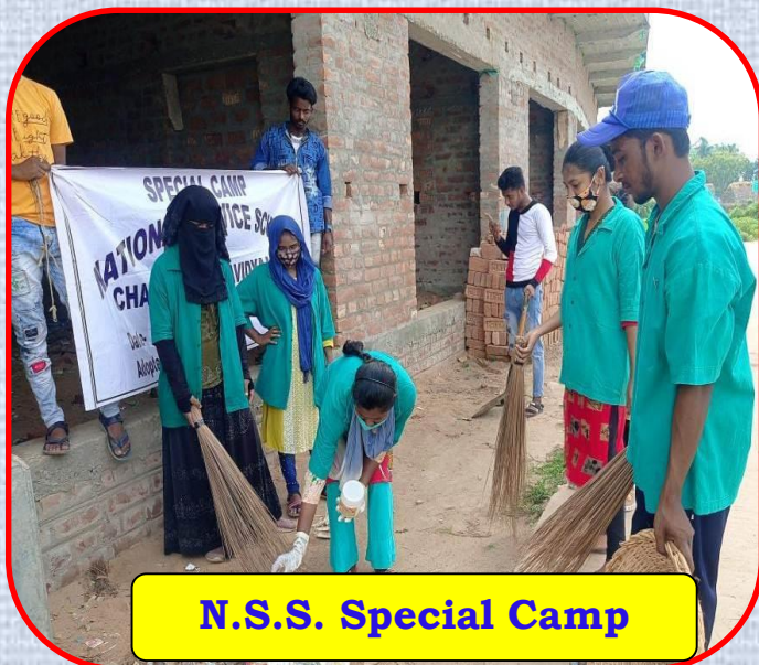
N.S.S. Special Camp