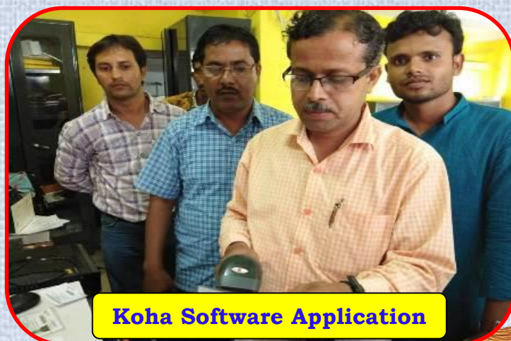
Koha Software Application