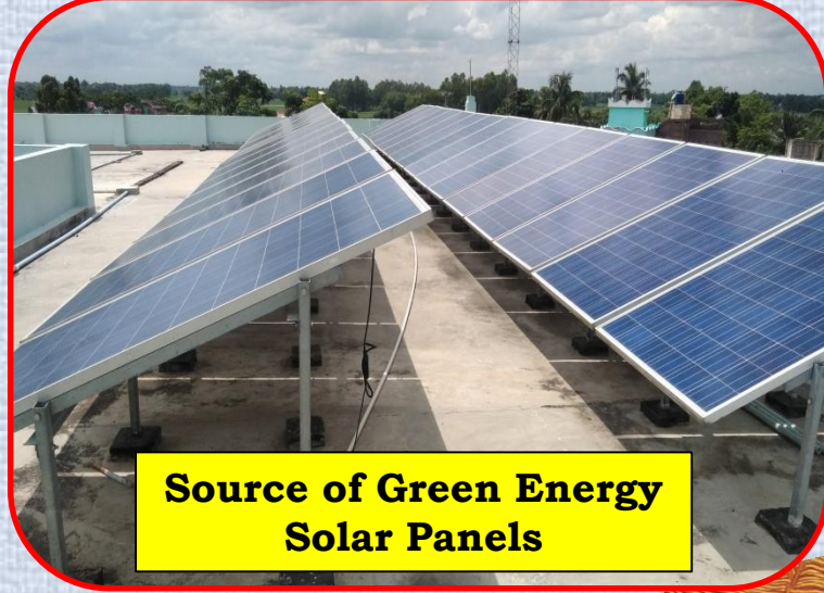
Source of Green Energy Solar Panels